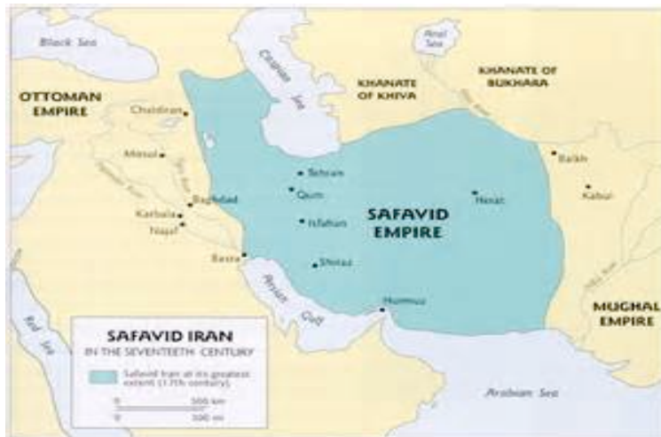
SAFAVID EMPIRE-PERSIAN EMPIRE-IRAN TODAY